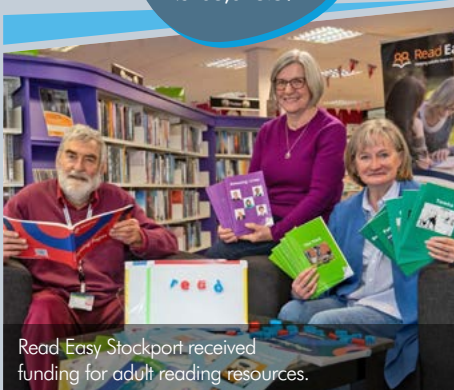
Read Easy Stockport received funding for adult reading resources.

70 grants have been awarded, amounting to £103,023.59